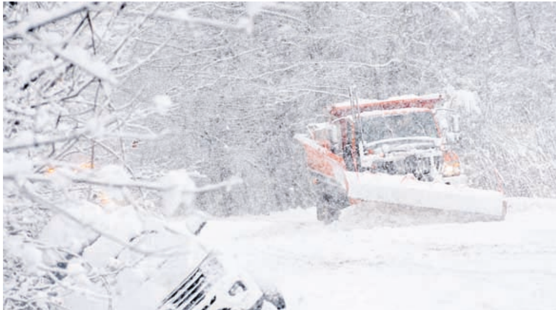
A state plow truck clears the snow along Route 30 in Jamaica, Vt., during a snowstorm on Friday, Dec. 16, 2022.